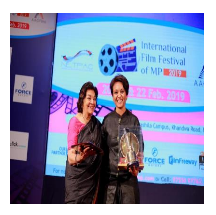
Indore, for Udne Do

In Hyderabad Govt. of India's NIRDPR awards for Free Fair Fearless