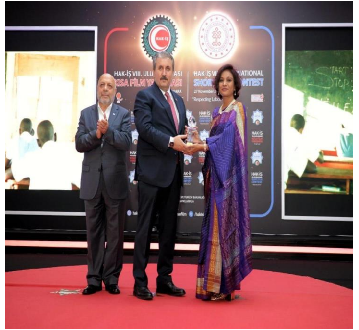
In Turkey, Ministry of Culture & HAK is federation Award Udne Do